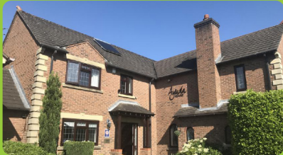
Ayuda House, Manchester

Even if the original fixtures have been replaced or repaired or if the property has had significant renovations.