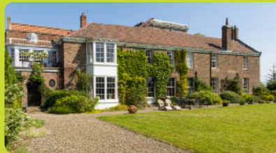
South Wing Holiday Home

"I came across Zeal during a PASC webinar. I contacted them and they explained the process and the benefits - basically a sizable capital allowance and a tax saving of almost £30k. The whole exercise took a few weeks, was super simple and the Zeal team explained everything very clearly. I highly recommend them."