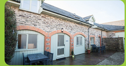
Smythen Farm Cottages

"Wow . . . I can't fault them in any way. It is not often you receive a call that leads to over 100K in tax savings. Well that's what happened. Fantastic service, great people to deal with and a speedy outcome."